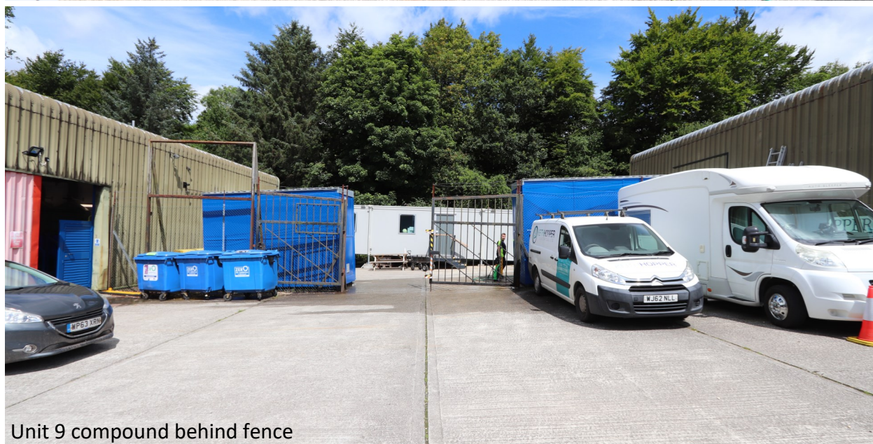
Unit 9 compound behind fence