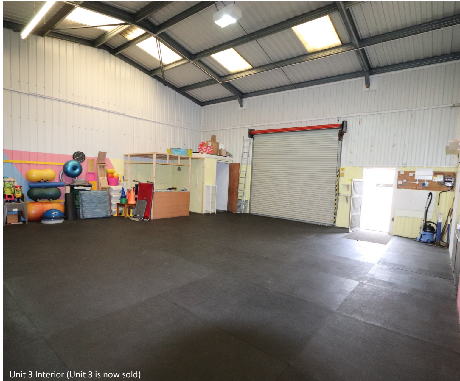
Unit 3 Interior (Unit 3 is now sold)

North Cornish beaches from 17 miles by road (Crackington Beach), Railway services are available at Okehampton railway station (21 miles by road) and Exeter airport services international and domestic flights (50 miles via dual carriageway). The A30 dual carriageway can be joined approximately 1 mile by road and the A39 Atlantic Highway (15 miles by road).